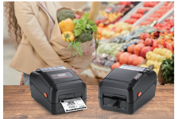
XL5-40 Exclusive Linerless Printer