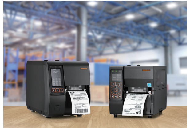
XT5-40 Series and XT3-40 Industrial Printers

XI enables users to streamline labelling operations by simply connecting peripherals into the printer preloaded with BAS files. The XI status (Stop / Running) can be easily controlled on the printer's LCD display.