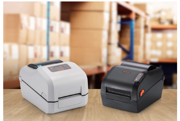
XD5-40 Series Desktop Printers